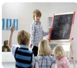
Learning styles & knowledge transfer