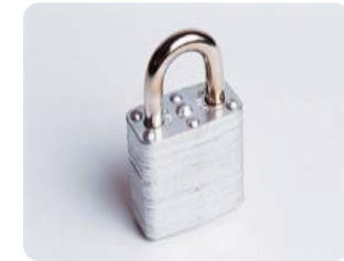
Risk & security management