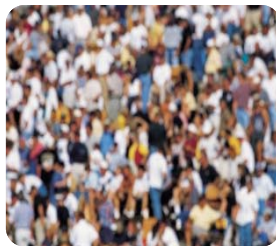
Open innovation & Crowdsourcing