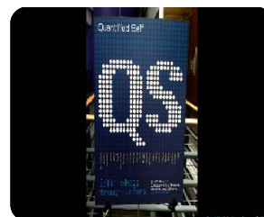
Analytics & Quantified Self